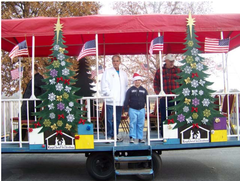
KC Float in the Granite City Holiday Parade