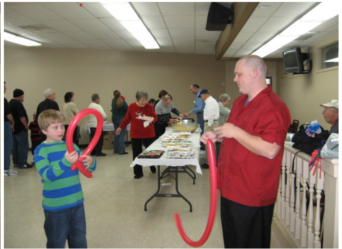
Fun was had at both the kid's & adult Christmas parties.